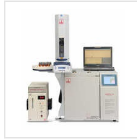
Head Space TOGA Analyzer