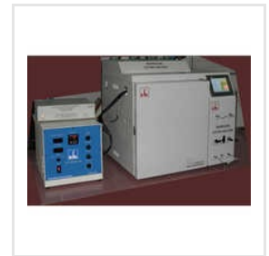
Trace Gas Analyzer