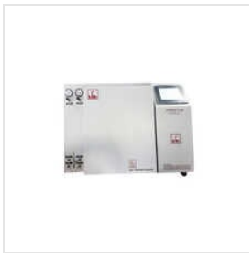
Online Gas Chromatograph For