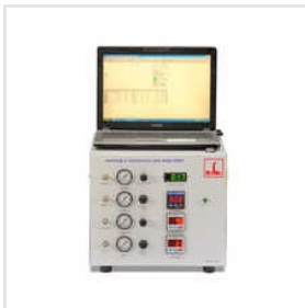
P-Micro DGA Analyzer