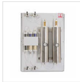
Zero Air Gas Generator