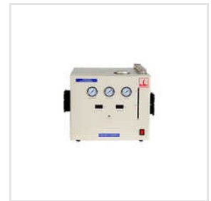
Combination Gas Generator