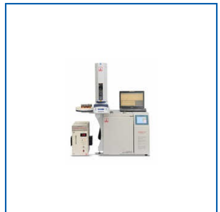
GC DHRUVA SYSTEM