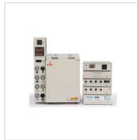
GC 2010 Gas Chromatographs