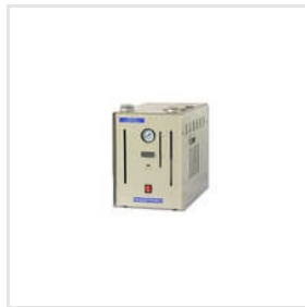
Nitrogen Gas Generator