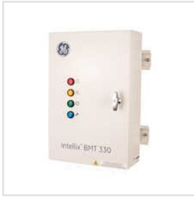
Online PD DGA