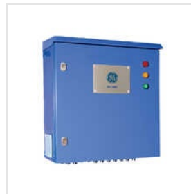
Online Transformer Monitoring System