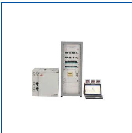
ONLINE GAS CHROMATOGRAPH FOR PILOT STUDIES

Carbon-Sulphur Determinator, Combination Gas Generator, Dhruva SC5 2020 Maintenance Free Breather, GC 2010 Gas Chromatographs, GC Dhruva System, Head Space TOGA Analyzer, Hydrogen Oxygen Nitrogen Combined Determinator, Nitrogen Determinator Oxygen, Nitrogen Gas Generator, Online DGA, Online Gas Chromatograph For Labs And R And D Units, Online Gas Chromatograph For Pilot Studies, Online PD DGA, Online Transformer Monitoring System, P-Micro DGA Analyzer, etc.