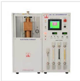
Nitrogen Determinator Oxygen