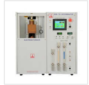
Hydrogen Oxygen Nitrogen Combined